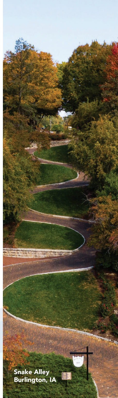
Snake Alley Burlington, IA