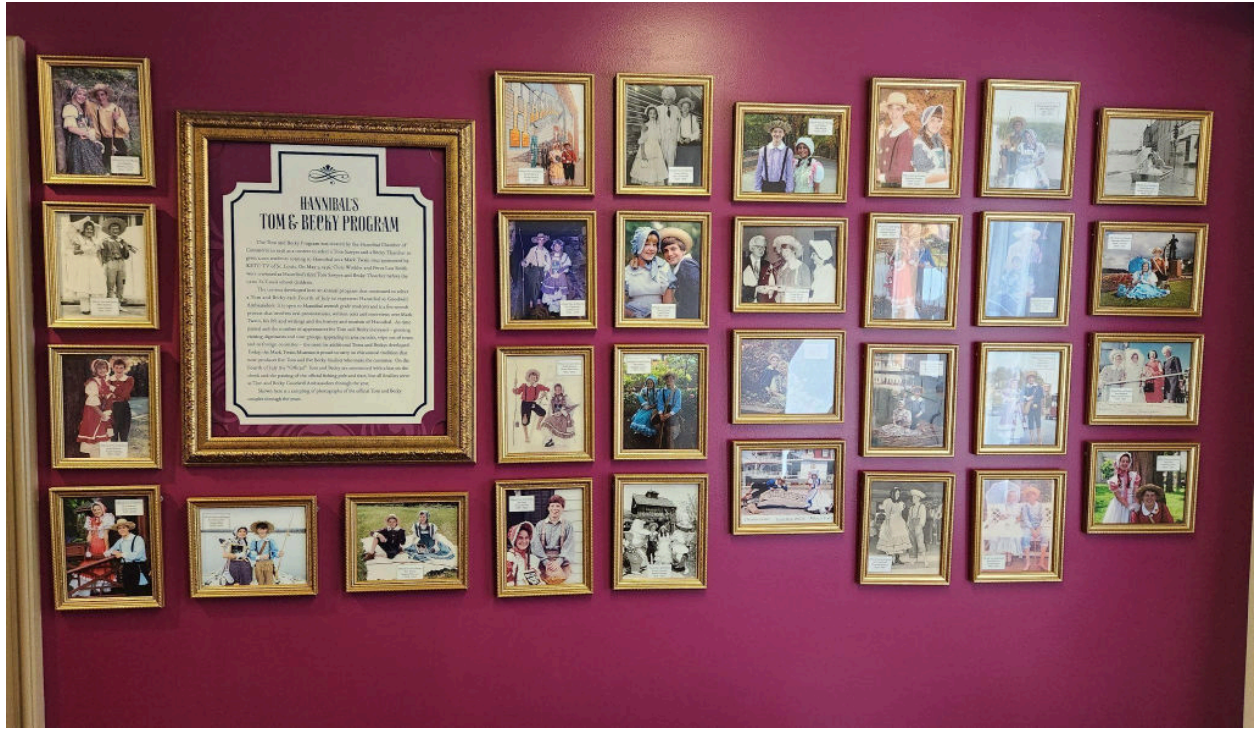
Each year, Tom Sawyer and Becky Thatcher return to the streets of Hannibal, as goodwill ambassadors who welcome visitors, bringing history and Twain's fiction to life.