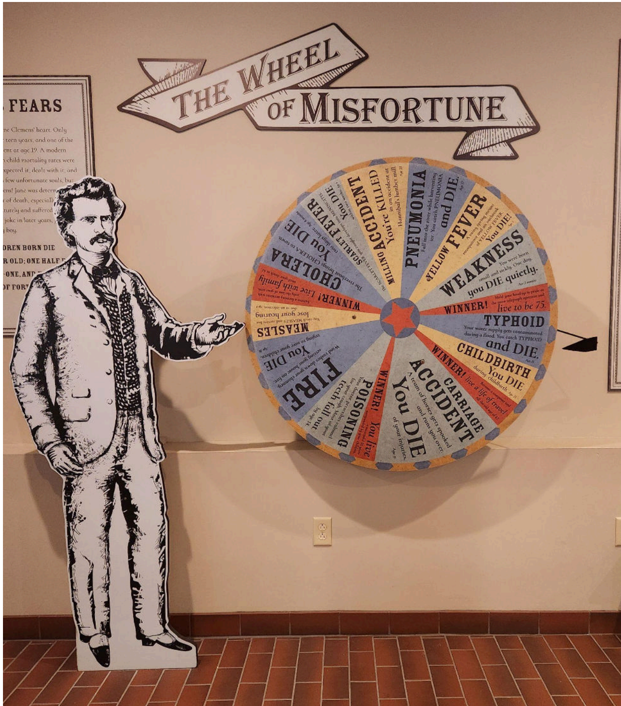
As visitors prepare to leave Grant's Drug Store, which includes several exhibits on mortality rates, illnesses, and epidemics during the time period, they can try their luck and spin the Wheel of Misfortune, seeing whether they will live or die (and if they die, their cause of death).