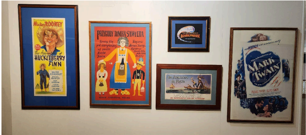
Twain's work has inspired countless film and popular culture adaptations. Advertising posters and art for several of these adaptations are on display on the second floor of the Museum Gallery.