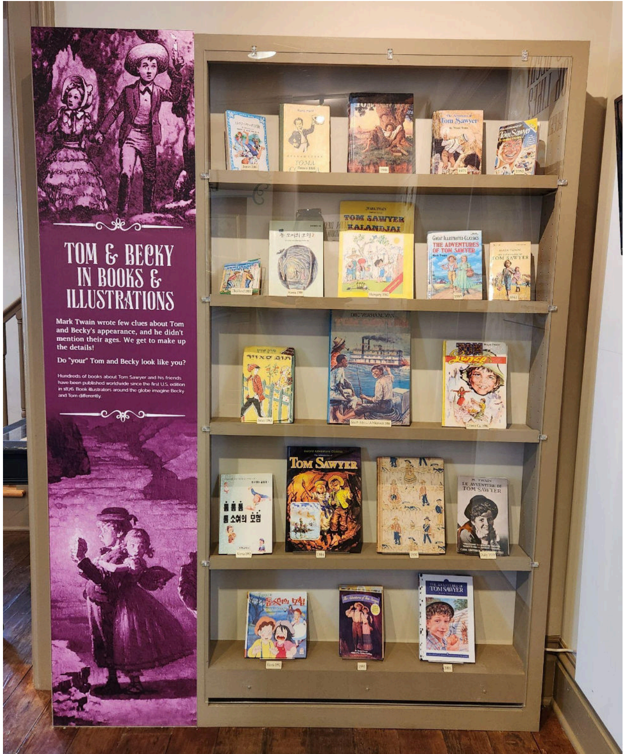
The Mark Twain Boyhood Home and Museum is also dedicated to celebrating the lasting legacy of Twain's work, including displaying many different copies of Twain's books, including international editions of The Adventures of Tom Sawyer .